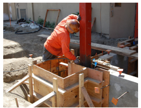
Vibrating the concrete in the elevator structure footing to help it settle and remove air voids.