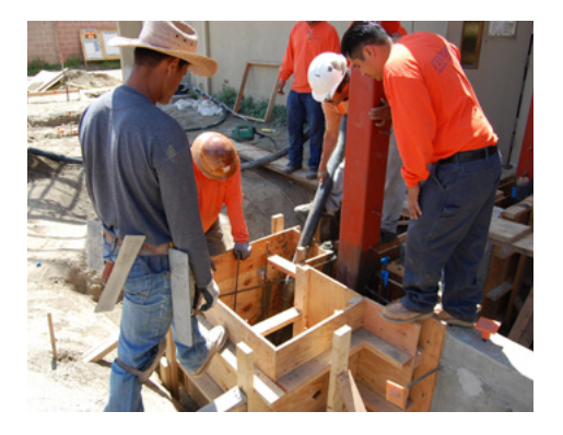
Pumping concrete into the elevator structure footing.

The painting contractor finished spraying the final coat of paint on the south and east side of the building.